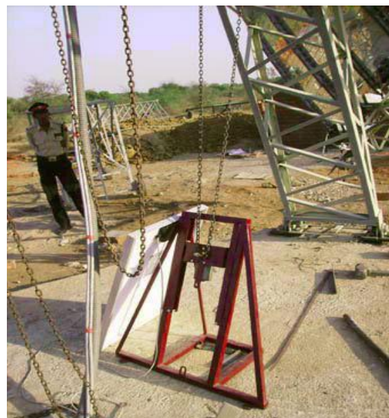
Fig 3: Automatic Tracking Stand for Small Scheffler Reflector

The whole structure is well balanced and easy to turn. It is made from light iron tubes and bars, which are softer in the places which require more bending (like near the focus) and stiffer where less bending is appropriate (the areas far from the focus).