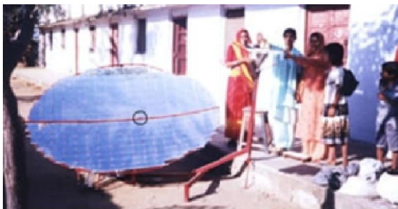
Manual changing of length of the reflector's rear support for seasonal adjustment

The power output varies with the season (Fig: 2). The Sun which shines more from the front into the reflector sees a larger reflector (large aperture), and thus more power is collected. In the same way, a sun shining more from behind sees a smaller reflector and less power is collected. A 2.7 m 2 reflector can typically bring 1.2 lts of water to boiling point within 10 minutes. The circle (see figure 5) at the center highlights the position of the lever for the seasonal shape change.